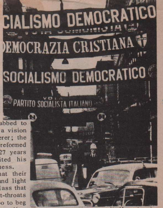
Party banners decorate Italian street

The Christian Democrats, who have been the major ruling party ever since the war, and who recently moved right to win back votes from the fascist MSI, gained one seat. The MSI practically doubled its representation - from 30 to 56 seats. The Communist Party gained only one seat and 0.3% of the votes. To its left, the PSIUP and the "Manifesto" group, which had 28 seats in the old Chamber of Deputies, was completely wiped out.