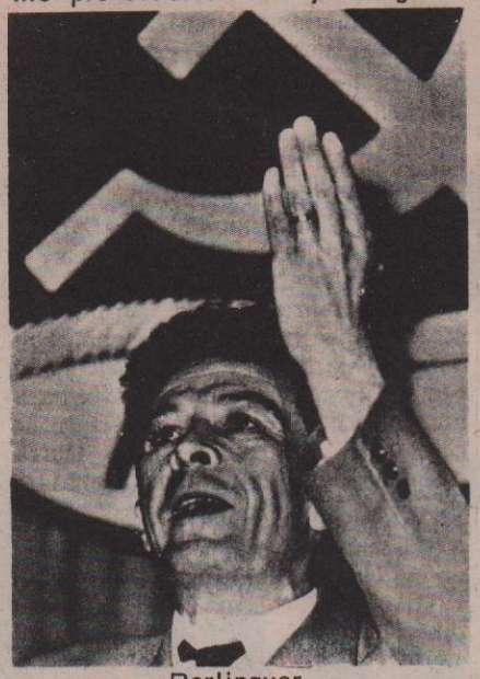
Berlinguer and ground the workers under fascism's iron heel.

He is even prepared to tolerate Italian membership of NATO and the EEC! The same newspaper wrote approvingly (10/5/72) of the CP's "great effort during the campaign to renounce its revolutionary origins and to pose as almost Social-Democratic Party." "This is not 1921, with the myth of a revolution just around the corner," said Pajette, another CP leader. It was just because the Italian Socialist Party in 1921 also regarded revolution as a "myth" and stood aside from the enormous wave of strikes and sit-ins, that Mussolini came to power in 1922