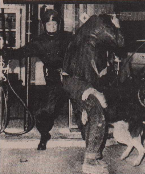
Anti-war demonstrator attacked by baton and dog.

It is necessary for those of us in the LPYS to put forward a clear programme based on the demands agreed at National Conference.