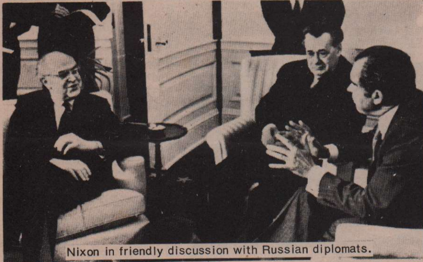
Nixon in friendly discussion with Russian diplomats.

The mining of Haiphong harbour and other North Vietnamese ports, is a desperate ploy of a falling colossus. But with its downfall in South-East Asia, it is making sure that it drowns in a sea of blood - Vietnamese blood. That arch representative of a decrepit capitalist cynicism, Nixon, said: "There is only one way to stop the killing. That is to keep weapons of war out of the hands of the international outlaws of N. Vietnam."